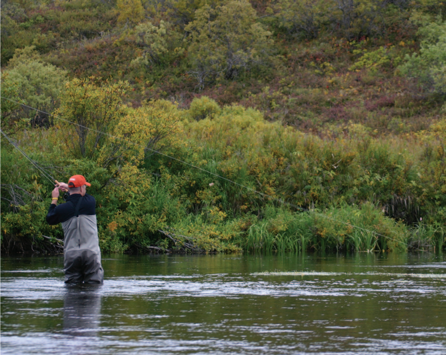
Clockwise from top: off current back water, like the area pictured here, makes for ideal mousing conditions; the helicopter dropoff point was at an elevation of 3000 feet and was 90 miles from the ocean; relaxing at camp; and a fine Dolly Varden.

As we began to meander down the river our minds were momentarily taken away from fishing when a majestic Stellar Eagle soared above us. Bear trails lined the banks of the river, and although the bears had vacated the area in search of berries during that time of year, the occasional fresh track always kept us aware of our surroundings.